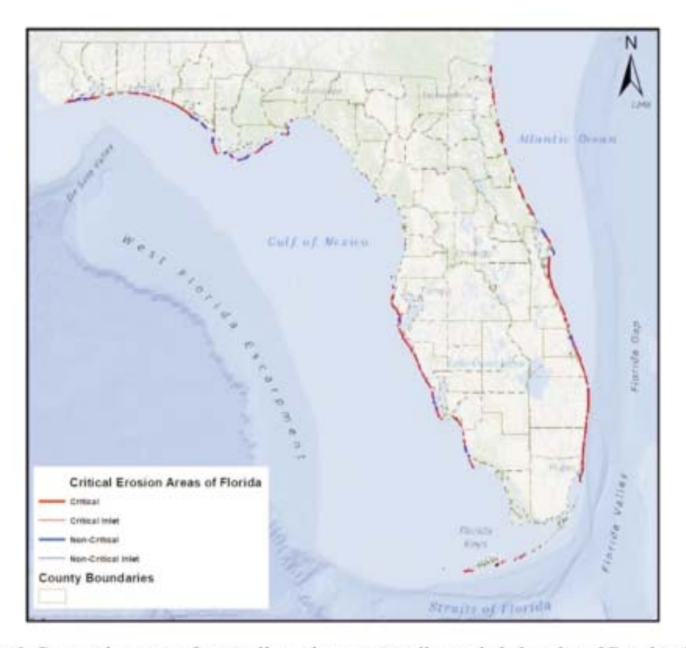
Figure 1. Statewide areas of critically and non-critically eroded shoreline [Graphic from <u>ROSS</u>] database]. View an <u>interactive map</u> with aerial imagery showing R monuments and the critical erosion areas.

shore. The disruption to the seabed in dredged areas is extremely harmful to many marine organisms. When the sand is subsequently deposited on designated areas, marine organisms are often smothered or negatively affected by the increased turbidity of the seawater. While some species such as sand dollars may benefit from fresh expanses of new sand, this is the exception. Given the extent of beaches designated as critically eroded, Florida's beach replenishment program is bound to have contributed to a decline in populations of shell-bearing mollusks.