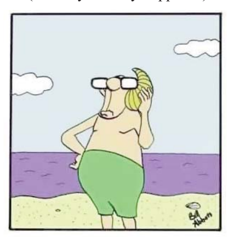
"To hear the ocean in English, press one. Para Espanol...."