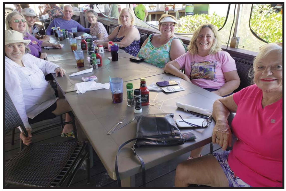
Lunch after Kice