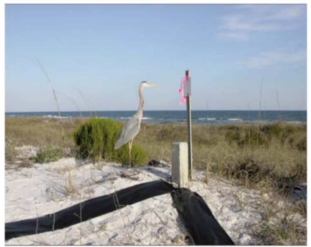
Figure 1. Range monument R-32 on Perdido Key in Escambia County, Fl.

Beach replenishment can have devastating effects upon the marine environment, including mollusk populations. The sand used for replenishment is sometimes mined from inland deposits. Often, however, it is dredged from off-