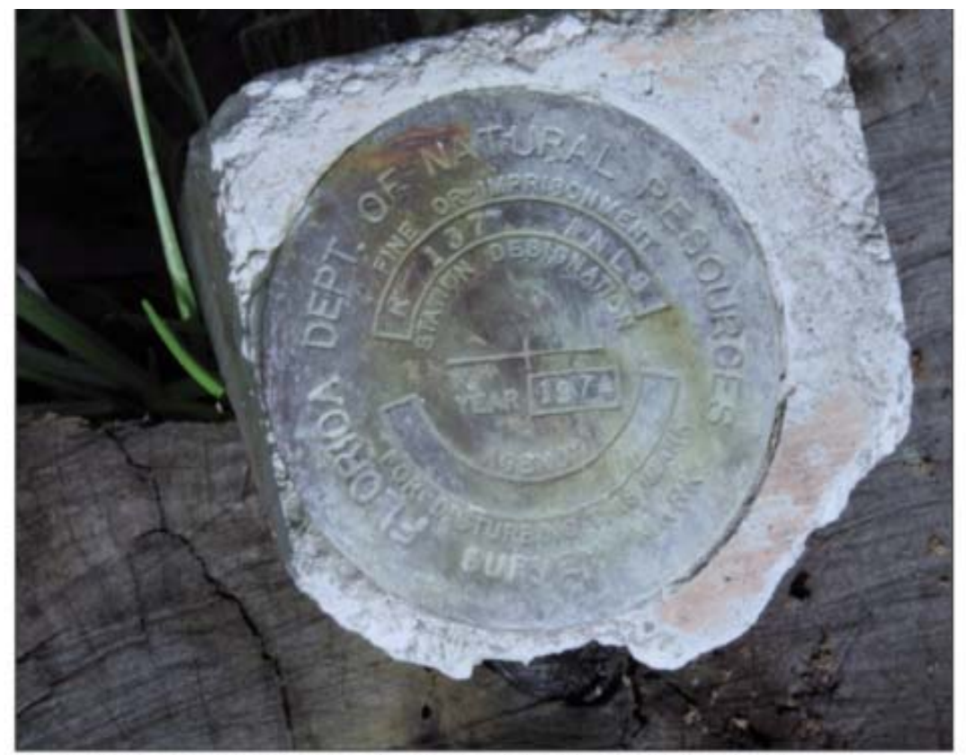
Figure 2. Range monument R-137, Treasure Island in Pinellas County, Fl.