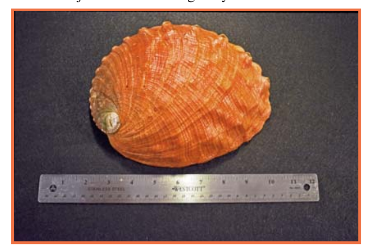
The Haliotis rufescens, showing a typical size for this species.

A love affair can be defined as something that stirs your passion and desire, which in my case, is exactly what happened with abalones. My fascination and love of the Haliotidae family developed back in the mid 1980s on a trip to Sanibel Island. I was in Showcase Shells visiting with the owners and longtime friends, Al and Beverly Deynzer, and out of the blue, I became interested in this family, due to their size and so many different color variations. As with so many shell collectors, color in shells attracts my interest, usually leading to further study, and eventually collecting the various species in that family. From that initial conversation at Showcase Shells, my love for abalones took off and has continued to grow right up to this very day. After over 30 years of collecting them, I still have the passion to purchase choice specimens. My collection has grown into several thousand over the years. I see a beautiful specimen and the urge to buy it just takes over, although I probably have several of that species in my collection already. As my wife would often say, "It is just a disease," and she was absolutely correct. I hate to admit it, but she was right. Even today, nothing has changed in my desire to grow my abalone collection, as they are at the top of my shopping list when I enter a shell shop, attend a shell show, or gather at the COA bourse. It just seems I can't get my fill.