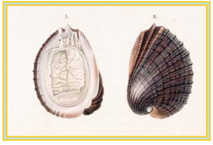
An 1831 drawing of the Concholepas concholepas from le Concholepas Peruvien.

An interesting video on YouTube shows fisherman boxing up a days haul of Locos to go to market: https://www.youtube.com/watch?v=U5KeoaphvJo