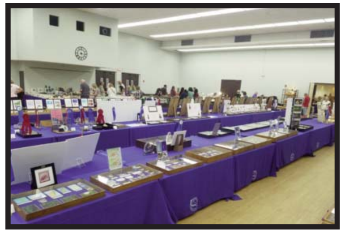
An overall view of the scientific portion of the show.