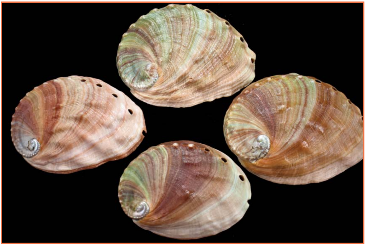
Here are four color variations of Haliotis rufescens; there are many, many more.

Haliotis rufescense is commonly referred to as the "Red Abalone." It is the largest of all abalones growing to over 300 mm in size. The shell can be solid red or in stripe variations, due to the food source the animal has been feeding on. The major food source centers around algae and large kelp that grows on rocks and other substructures. There have also been some albino specimens recorded. It is the California State sea shell.