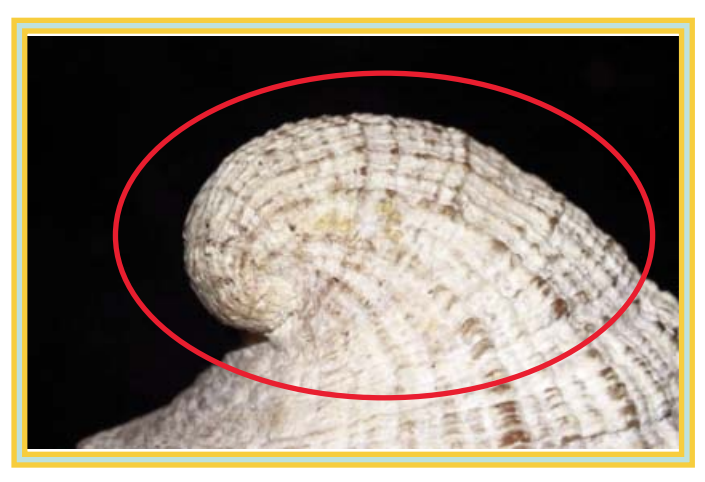
A side view of the shell detailing the Phrygian cap (highlighted in red).

It has a small operculum which is not of much use as the animal protects itself by using its muscular foot to attach to rocks, thus protecting itself from predators. An unusual physical characteristic is that the top of the shell resembles a Phrygian cap (according to Wikipedia : the Phrygian cap or liberty cap is a soft conical cap with the apex bent over, associated in antiquity with several peoples in Eastern Europe.