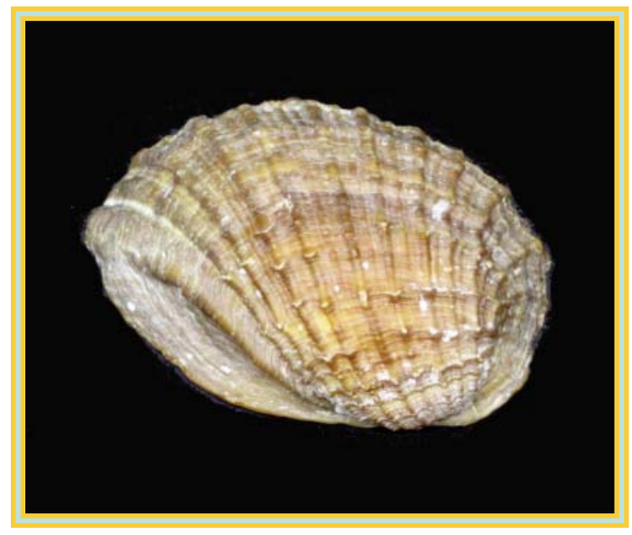
A topside view of the Chilean Abalone shell. Note the distinct pattern of ridges.

Concholepas concholepas is a species of gastropod (yes, it looks like a bivalve but it <u>is</u> a gastropod) that is native to Chile and Peru. Known as the Chilean Abalone or Barnacle Rock Snail (and sometimes, "Loco") this mollusk is similar to the abalone. It belongs to the Muricidae family.