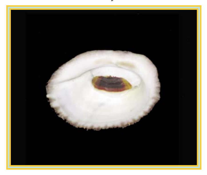
The opposite or bottom reveals space for the animal and the diminutive operculum.

It is very edible and is a highly prized seafood imported into the Asian markets. In Chile the shell is sometimes used as an ashtray.