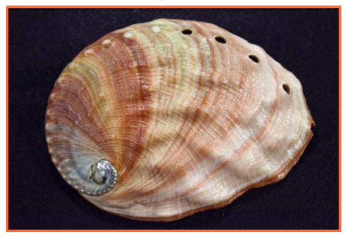
A pleasant color variation of Haliotis rufescens , detailing both sides of the shell. Note the iridescence on the inferior aspect in the photo

on the largest abalone in the family on the West Coast of North America, Haliotis rufescens Swainson 1822.