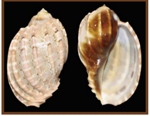
Two views of a typical Harpa major . Shells courtesy of Sue Hobbs

Harpa major Röding, 1798 January's Featured Mollusk