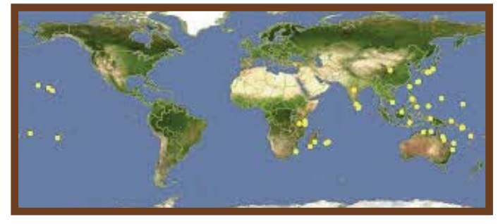
Distribution of the Harpa major.

The Harpa major is a reddish brown with some pink. The shells of the male are narrower than those of the female.