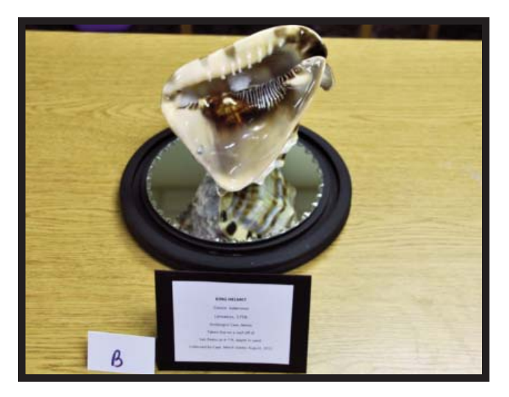
Other Shoebox Exhibits include a King Helmet (above); a display of Haliotis dissona (above, right) and a collection of the Banded Tulip Shells.