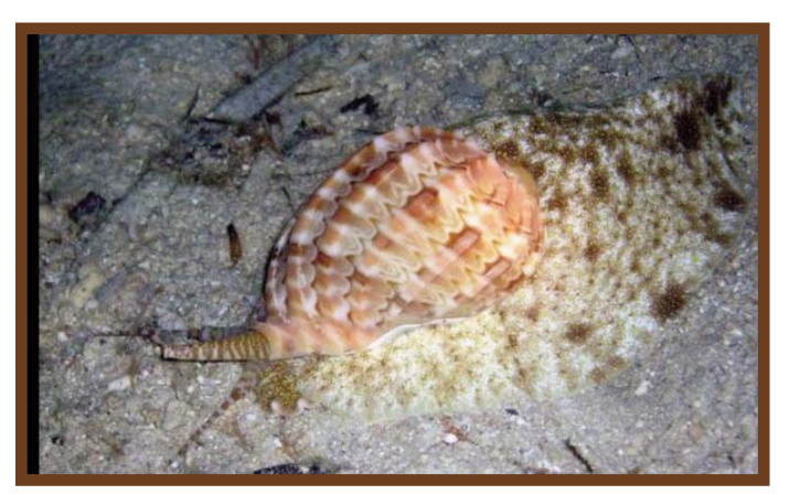
A live specimen of Harpa major.

The Harpa major , or Major Harp, is an attractive and interesting shell to hold and enjoy. It is found in the tropical Indo-Pacific plus the eastern coasts of the Pacific and Atlantic. It lives in deep water and digs into the sand.