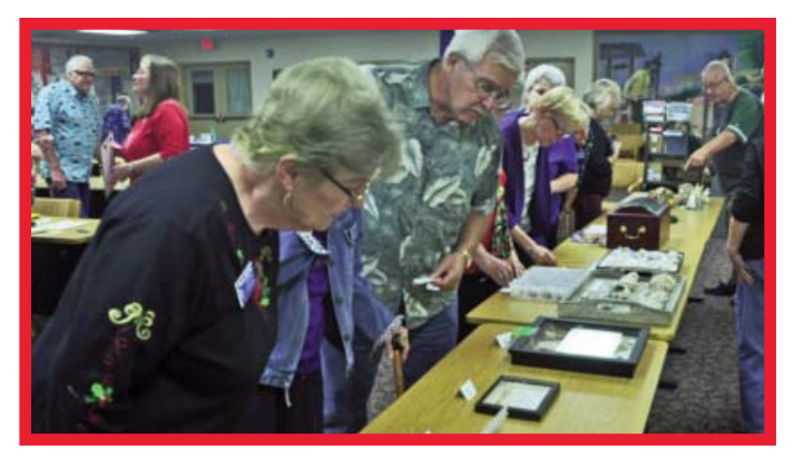
Members judging the Shoebox Exhibits.