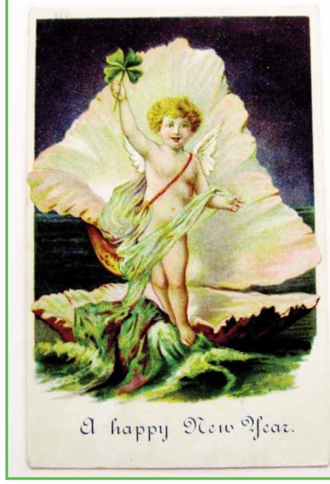
A happy New Year to all Sarasota Shell Club members!