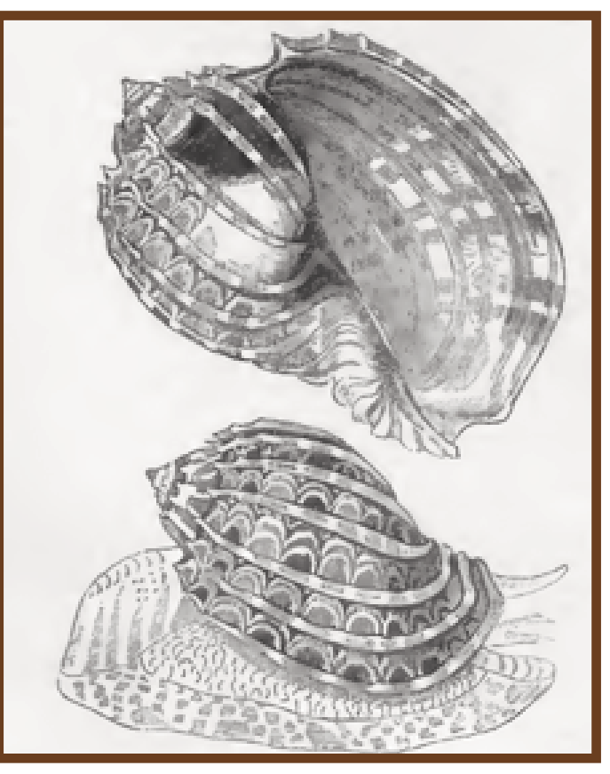
A drawing of the shell and live animal.