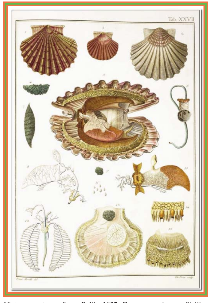
Vintage anatomy from Poli's 1827 Testacea vtrivsqve Siciliae eorvmqve historia et anatome. Also known as "Sicily Shells: History and Anatomy."