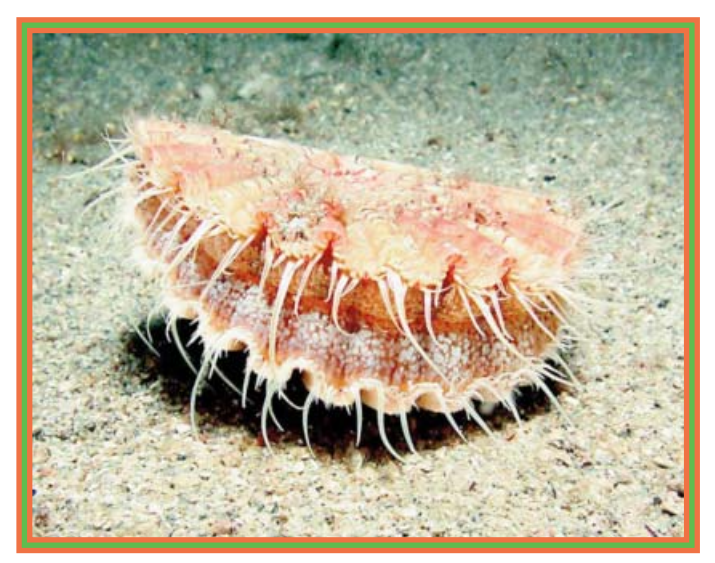
A photo of a live Pecten jacobaeus.

According to Wikipedia this species is associated with Saint James—(also known as James, son of Zebedee and also known as Saint Jacob, therefore giving the species name of jacobaeus ). It is also noted that it was known as the Pilgrims Scallop, as the shells were used by Middle Ages pilgrims as a cup.