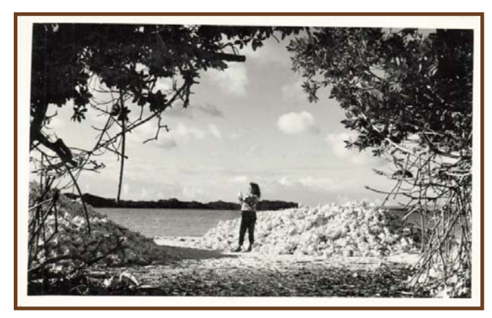
The postcard for March is this vintage, 1950s card depicting a pile of conch shells somewhere in the Caribbean.