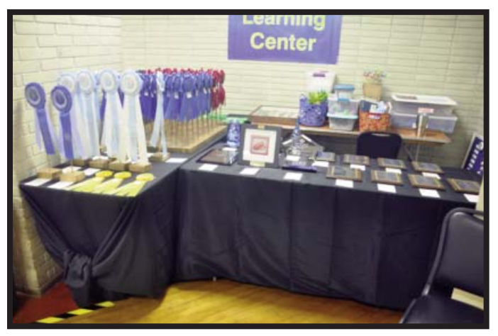
The awards table waiting distribution to the winning entries.