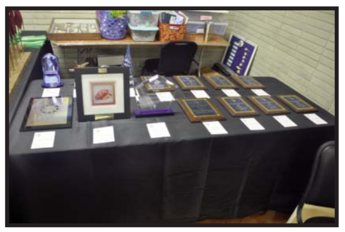
A close-up of the major awards to be given out.