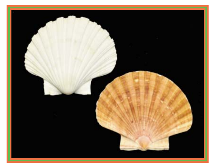
The Pecten jacobaeus - both valves viewed.