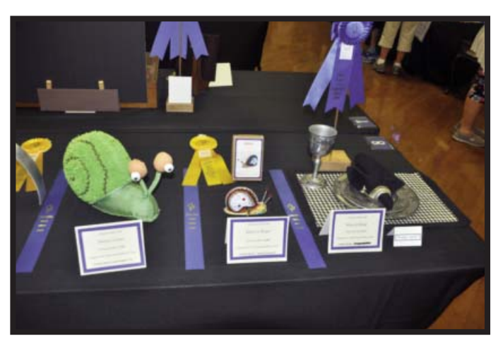
Some of the entries in the Snail Parade.