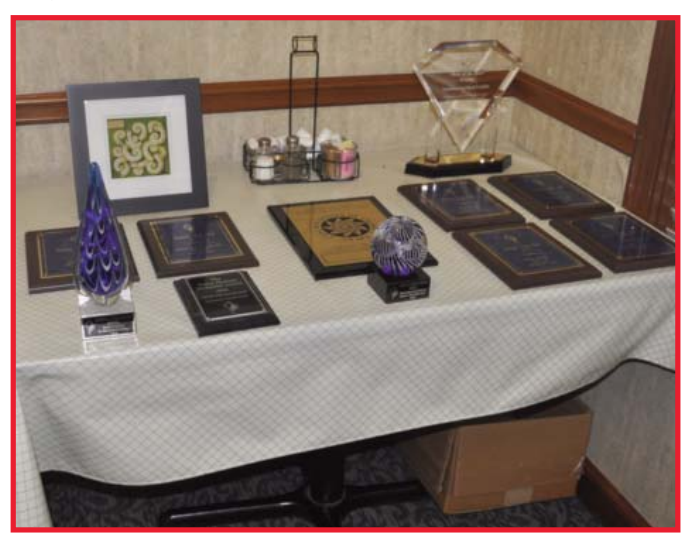
The Awards table at the "Judge's" Dinner.