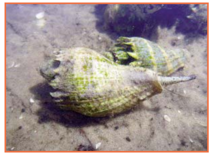
Figure 3. Crown conch with siphon extended and body out with foot.

bands encircle around their body whorl. They have a wide aperture (the large opening where the mollusk's body comes out of the shell). Adult crown conchs are usually dark brown with white to cream or yellowish bands encircling their shell. As adults, some crown conchs have spines curving out from their shell. An additional row or two of spines may grow near the bottom of the shell. The name crown conch comes from the row of spines that circle the top of the shell giving them a crown-like appearance. Immature or juvenile crowns have some purple coloration within their bands. Juvenile crown conchs do not have spines. Their spines will grow later in their life cycle. Figure 3 Crown conch with siphon extended and body out with foot.