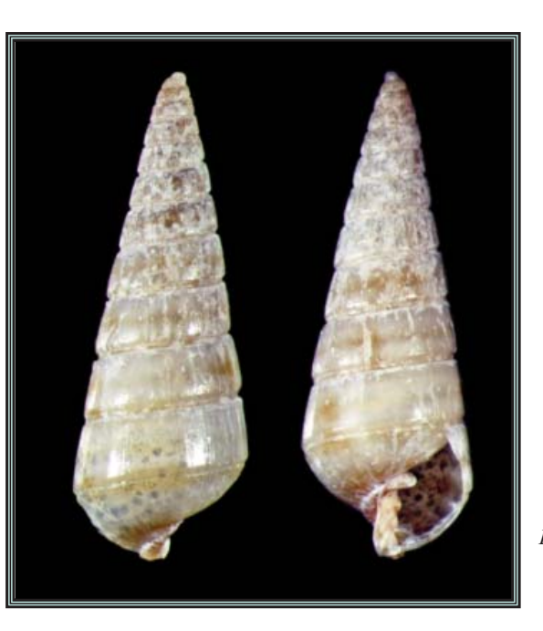
Longchaeus suturalis

The east area has a long expanse of beach to walk. There were few gastropods but a modest number of medium and small bivalves. Overall however this area was the least productive of species diversity. Among the most notable bivalves in this area were Crassinella lunulata, Tucetona pectinata, and Pteromeris per plana . Among the gastropods the most notable was a good shell of Longchaeus suturalis. Total species from the area I call east were five gastropods and 14 bivalves.