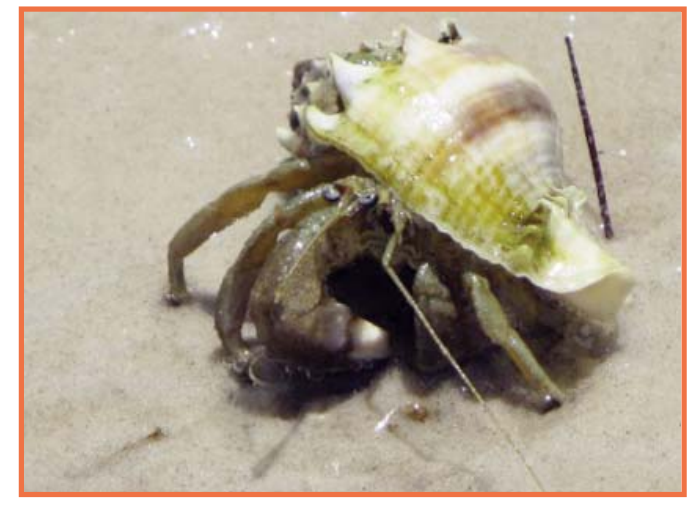
Figure 6. Crown shell with hermit crab.

species if there is a limited availability of food. Their thick shell can protect them from predators such as the horse conch, murex, and whelk species.