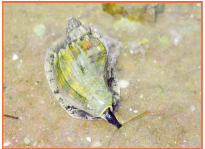
Figure 2. Crown conch photo with periostracum.

Melongena corona is a marine gastropod that has several common names. Sometimes it has been called the crown conch, American crown conch, and the King's Crown. Whichever name it is referred by, this mollusk is part of the Melongenidae Family. This species of mollusks can be found on both coasts of Florida, the Gulf States waters, and along the coast of eastern Mexico. They live in large colonies in shallow water mud flats among