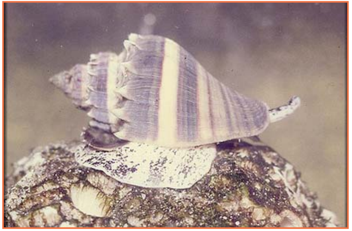
Figure 1. The Melogena corona or "Crown Conch."

Melongena corona is a marine gastropod that has several common names. Sometimes it has been called the crown conch, American crown conch, and the King's Crown. Whichever name it is referred by, this mollusk is part of the Melongenidae Family. This species of mollusks can be found on both coasts of Florida, the Gulf States waters, and along the coast of eastern Mexico. They live in large colonies in shallow water mud flats among