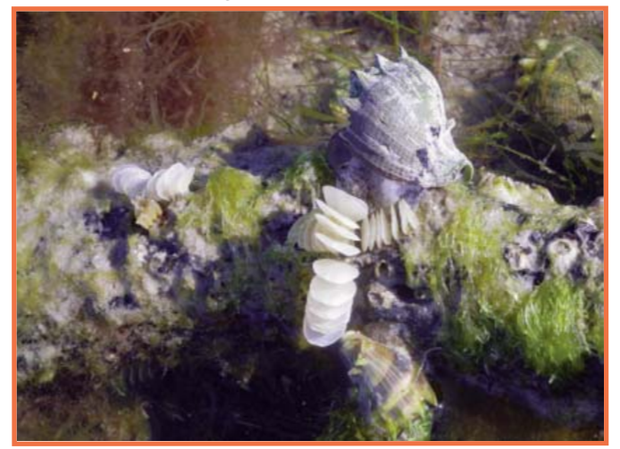
Figure 5. Crown conch egg capsules

Melongena corona are voracious scavengers. They will eat any dead or dying organism in their environment. Frequently, many mollusks will gather and eat from the same dead prey. They are carnivorous snails preying on other smaller mollusks (clams, mussels, and oysters) found in their environment. It is thought they may also be cannibalistic, eating smaller members of their own