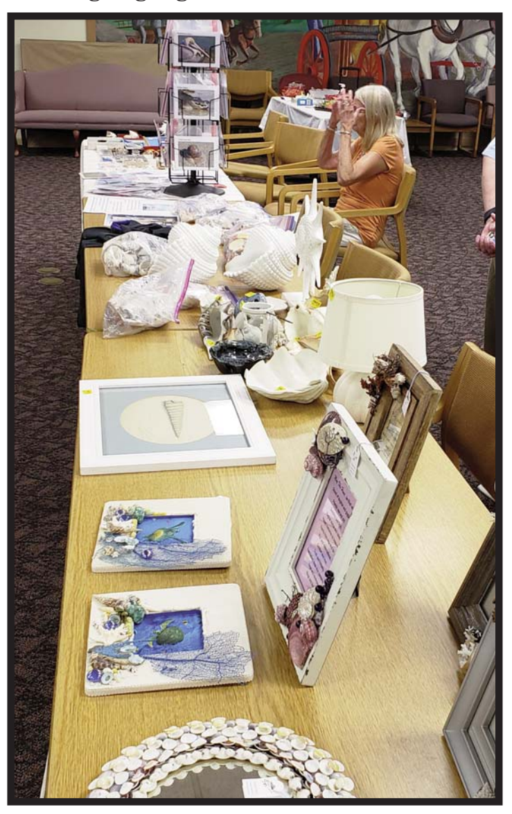
Sales were semi-brisk in the back of the room.