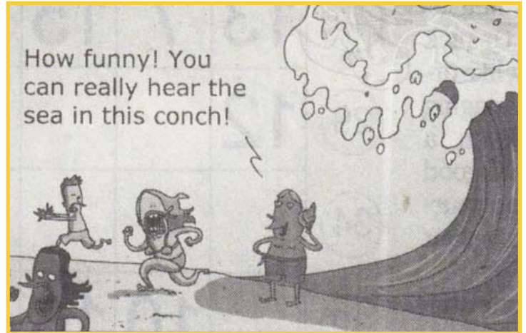
From a current Comic Strip