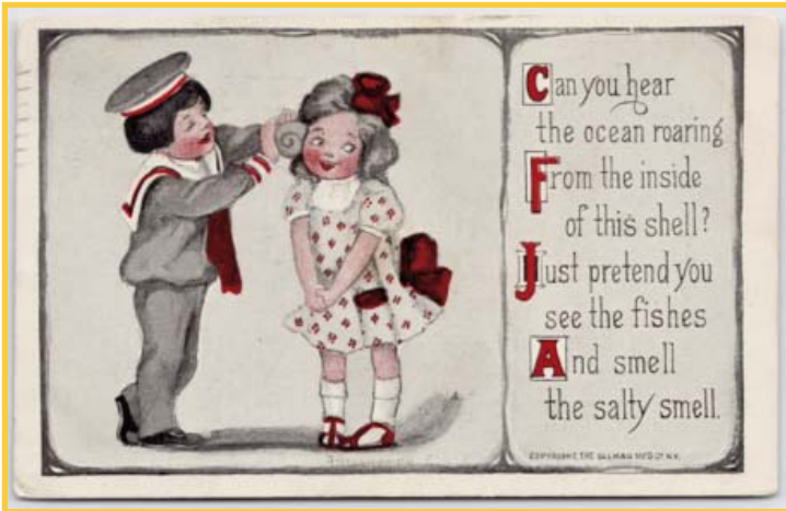
From a 1911 Postcard