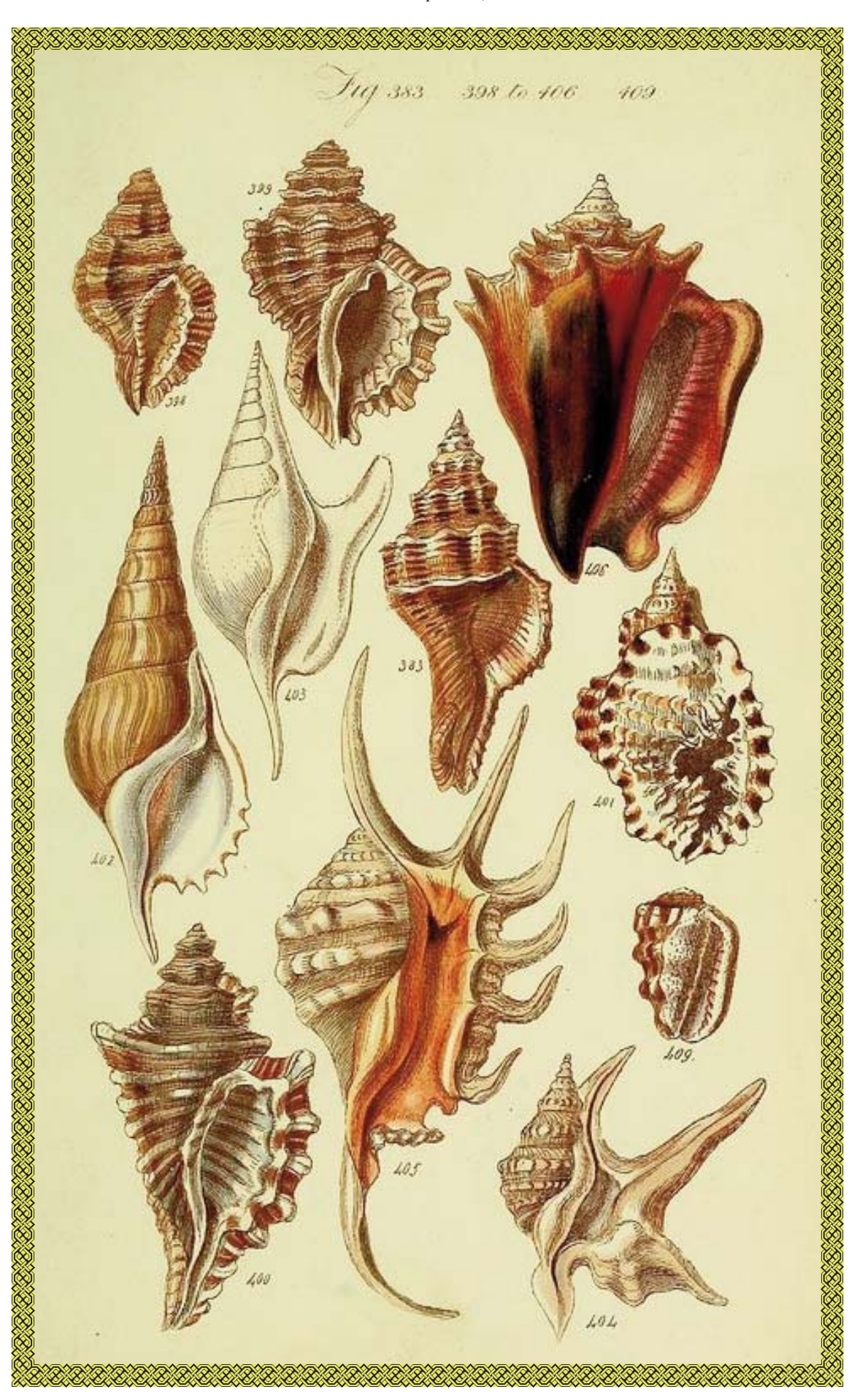
A page from Sowerby's 1839 A Conchological Manual.