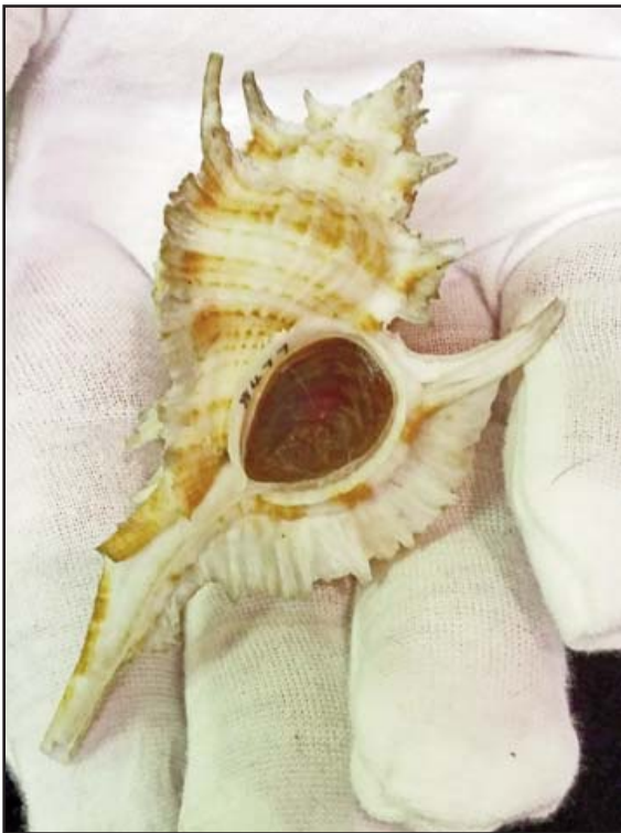
A Siratus beauii , the club's shell as seen in the hand of the auctioneer's assistant prior to the auction event. It was eventually purchased by the club (with board approval) for display at club events including our annual shell show.