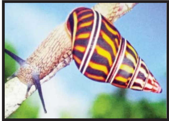
A screenshot of Adrián’s presentation: Liguus fasciatus .

Adrián González-Guillén and his co-authors have produced a magnum opus on a colorful and fascinating genus of tree snails, a genus to which south Florida makes a major contribution. It is by any standard one may think of the most complete, and most colorful, book on Liguus even published. Indeed, one must concede that the color photos of the seemingly endless forms of Liguus fasciatus might leave even the most interested tree snail enthusiast with a visual system yearning for a break. During that break one might wish to use the book as the weight for a series of power arm curls [the reviewer’s efforts to weigh the book yielded an estimate of seven pounds].