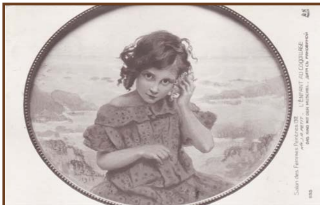
A 1919 French postcard showing a youngster holding a shell to her ear. The inscription noted Das Kind mit der Muschel or “A child with a shell”. It is interesting that the wording is in German while the postcard itself was made in Paris and the remainder of the writing on the card is in French.