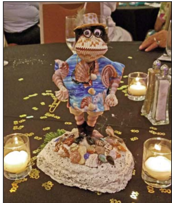
A shell-themed centerpiece adorned each table at the COA banquet.