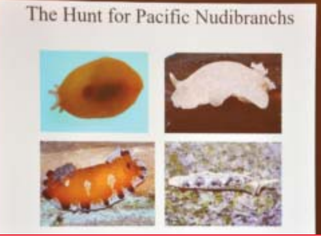
Gary Schmelz gave an interesting program on Nudibranchs