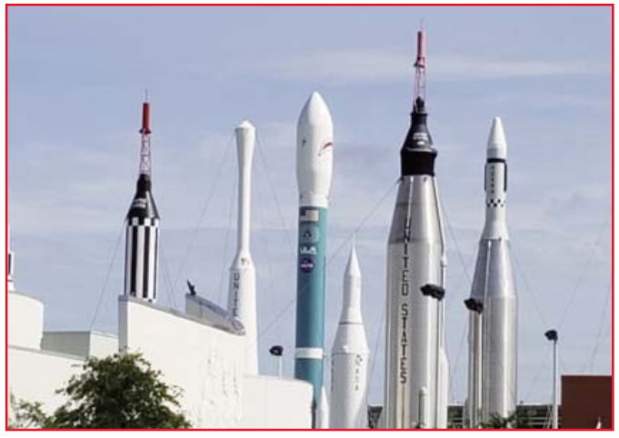
An optional excursion was a trip to the NASA facility