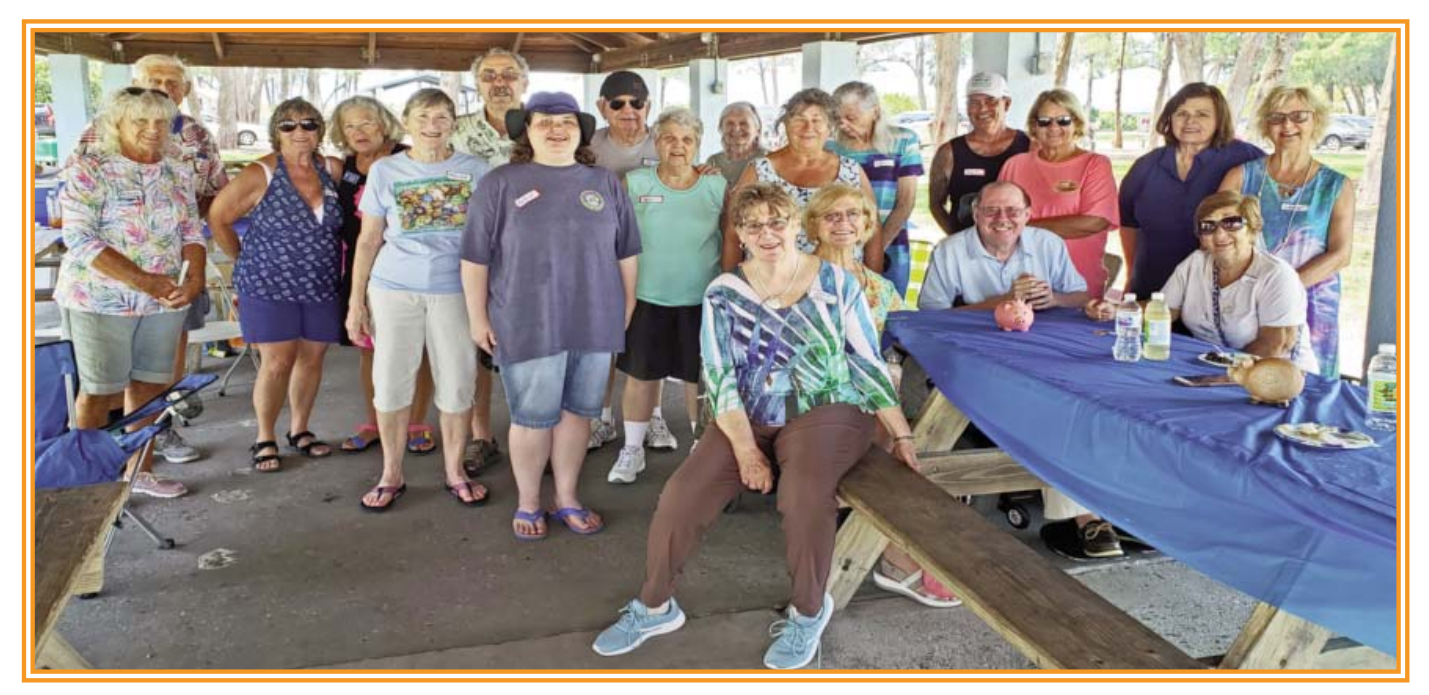
Members enjoying the club's annual picnic, held April 17th, 2021 at the Coquina Beach pavillion.