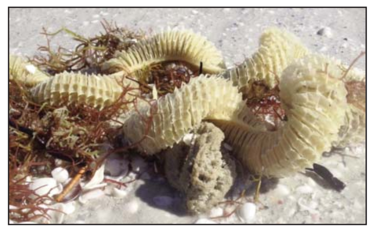
Figure 4. Lightning Whelk egg casing.