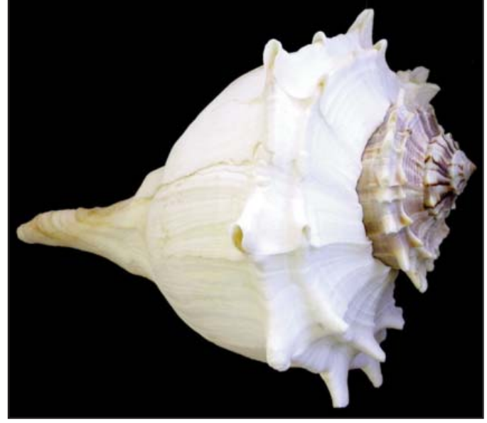
Figure 1. Left-side view of a Lightning Whelk.

Lightning whelk sea snails belong to the Busyconidae Family; commonknown ly as Busycon whelks. These mollusks edible. are an predatory, sea snail found along the Atlantic and Gulf coasts from New Jersey to Texas. Their scientific name is Sinistrofulgur perversum named by C. Linnaeus in 1758.