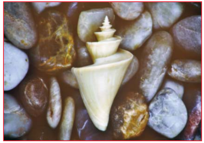
Just another fantastic photo from the workshops