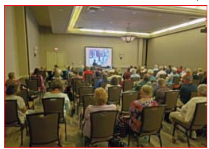
Workshops were well attended