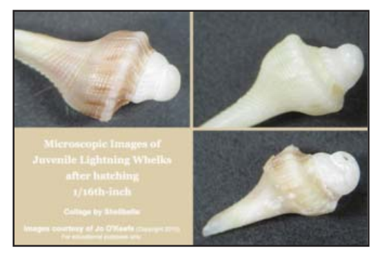
Figure 5. Lightning Whelk baby shells.

Early Native Americans had many uses for a lightning whelk mollusk. For thousands of years, they were an important food source. Discarded shell pieces were made into tools such as scrapers, gouges, hammers or net sinkers. Figure 6