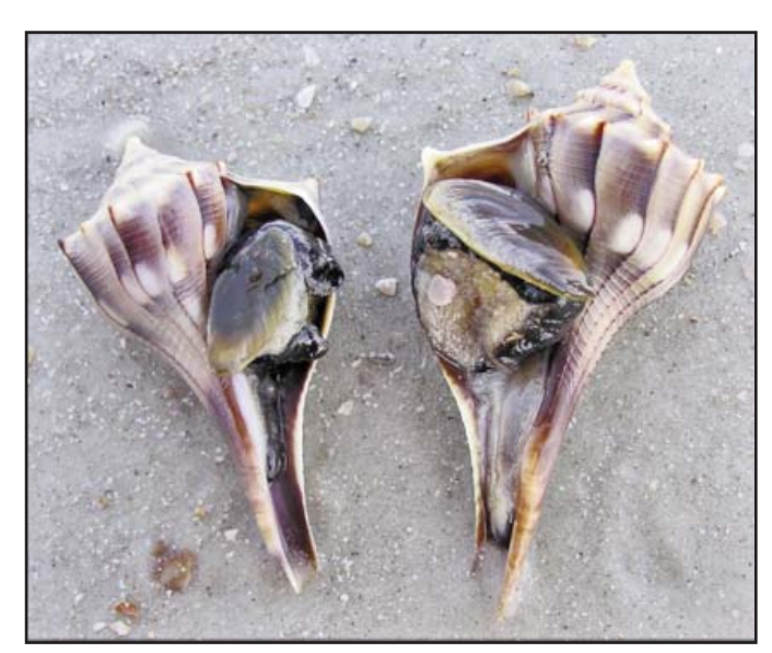
Figure 2. A photo of dextral and sinistral lightning whelks.

the aperture is on the left side of the shell coiling to the left side of the shell or in a counterclockwise direction. As a juvenile, they have chestnut or apricot brown colored stripes continuing around its shell in a zigzag pattern. These stripes resemble lightning bolts. Thus, their name lightning whelk. As they age, lightning whelks begin to turn white and lose their brown color. During their 20-30-year life, they can grow a shell 10-16 inches in length. It takes 8-10 years for a lightning whelk to grow an 8-inch shell. They live in shallow water in sandy or muddy bottoms coming out at night to feed. Figures 1 & 2