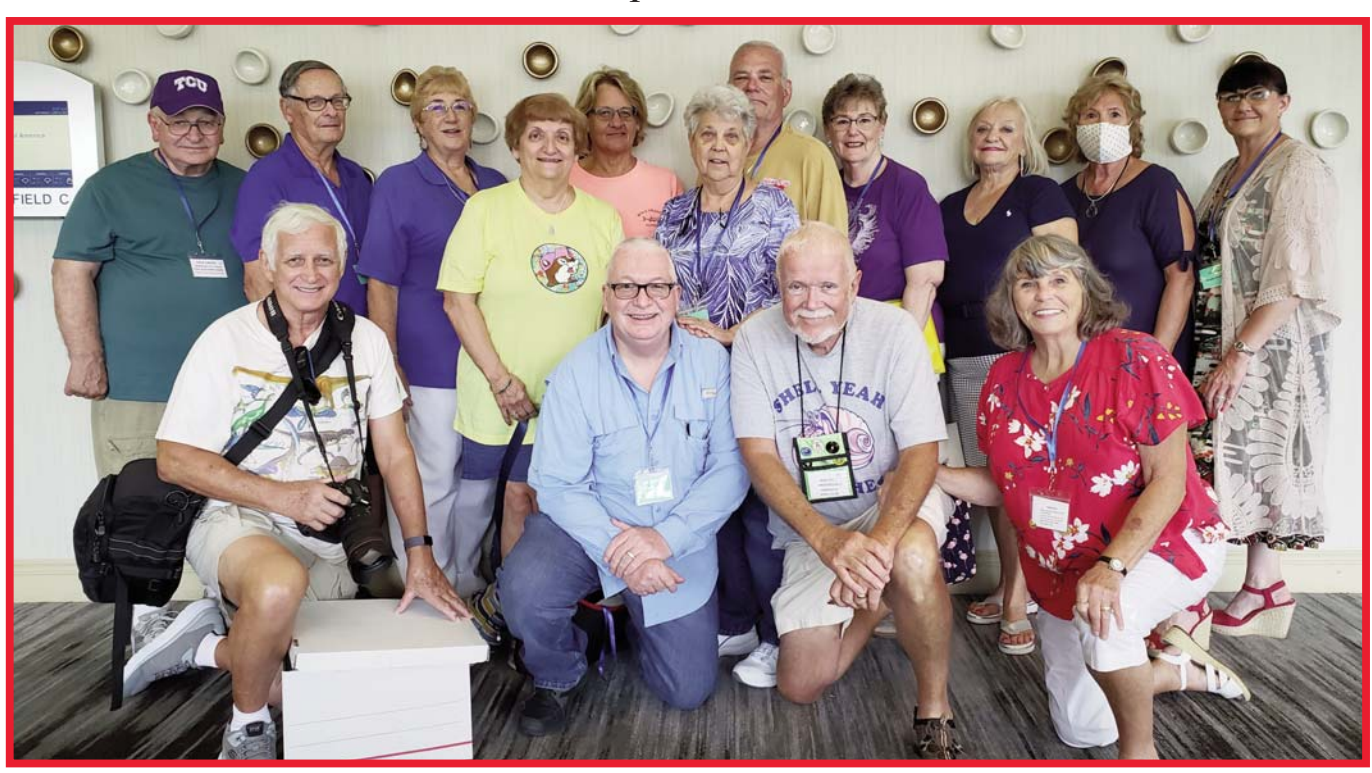
Club Members at the Space Coast COA—June, 2021