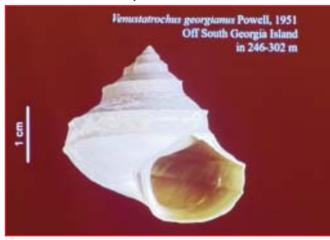
Just one of the hundreds of interesting photos at the workshops