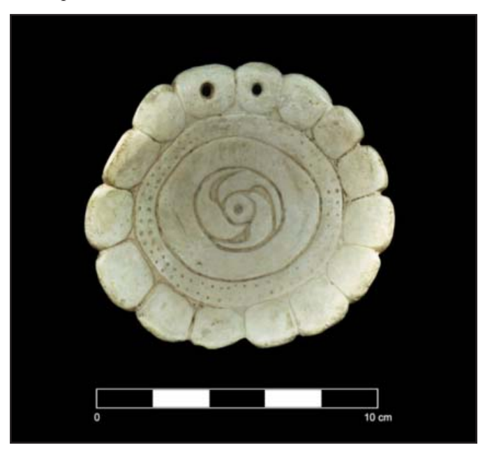
Figure 7. A shell gorget.

Experts think because of the sinistral nature of their shell they were used for religious purposes. Lightning whelk shells have been uncovered in Florida's fossil pits. These lightning whelk fossils are known by another name. They are identified as Busycon contrarium by Conrad, 1840. It is rare to unearth an intact specimen of this species in a fossil pit.