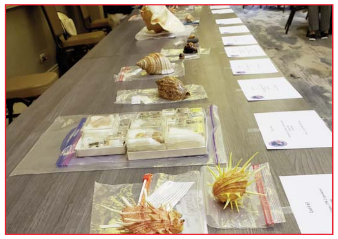
The oral auction provided a chance to acquire that special shell

And, Even More Convention Photos—June, 2021