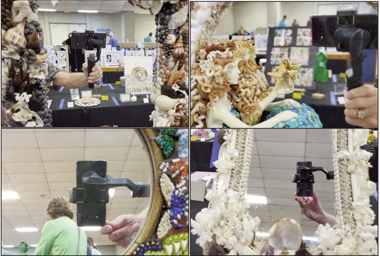
Finally an astute club member Photographed the Photographer in action