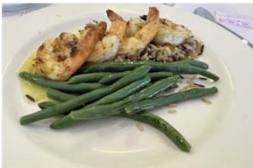
Grilled Shrimps in orange sauce